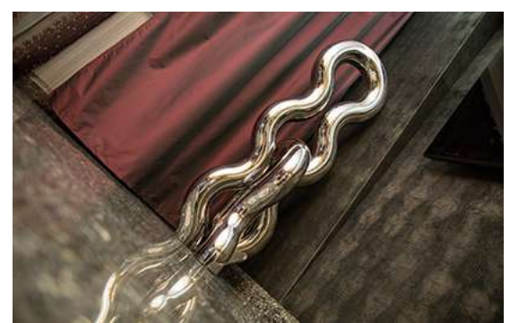
A modern interior installation made of stainless steel.